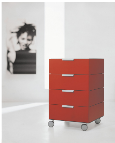
design Pietro Arosio

The basement is always in aluminium finishing while the top can be in the same finishing of the drawers or in aluminium finishing as well. The drawer units can be fitted with castors.