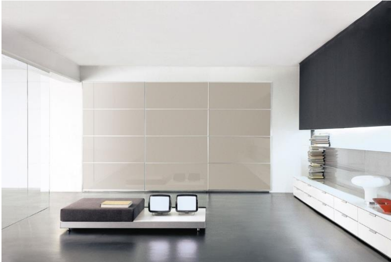
design: Pietro Arosio

A rigorous and clear impact for the frontal grid of the wardrobe Avantgarde: its sliding doors are made up of panels available with coloured glass available in different colours or in natural mirror with profiles in natural anodized aluminum. The wardrobe Avantgarde is available in different dimensions with 2 or 3 sliding doors.