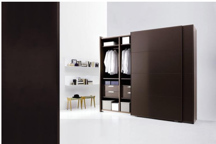
design: Pietro Arosio

Modern lines and handcraft finishing are the main features of Arkon: its sliding doors are completely covered with regenerated hard leather with seams in a contrasting colour or in the same one as the doors.