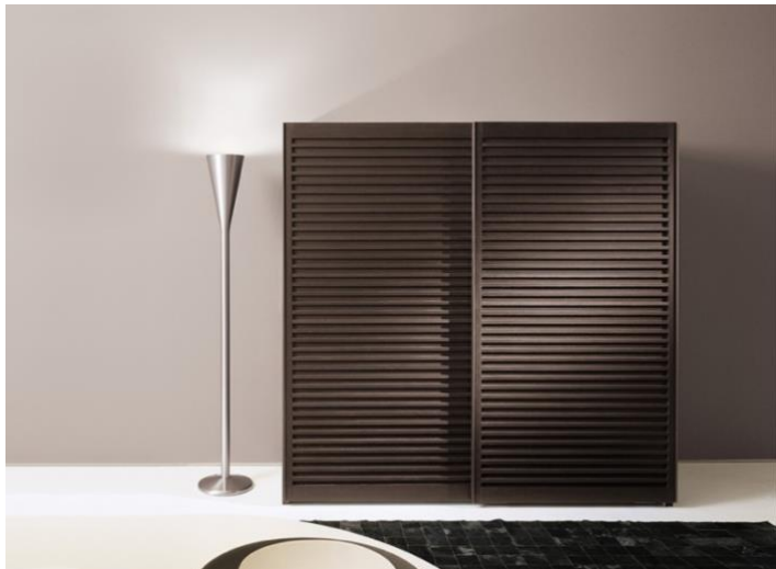
design: Pietro Arosio

Wardrobe characterized by doors with horizontal strips in wengè which recreate a clear oriental look. Sliding doors available in different heights and widths in order to adapt to different spaces. The internal fitting can be decided according to the desires of the client.